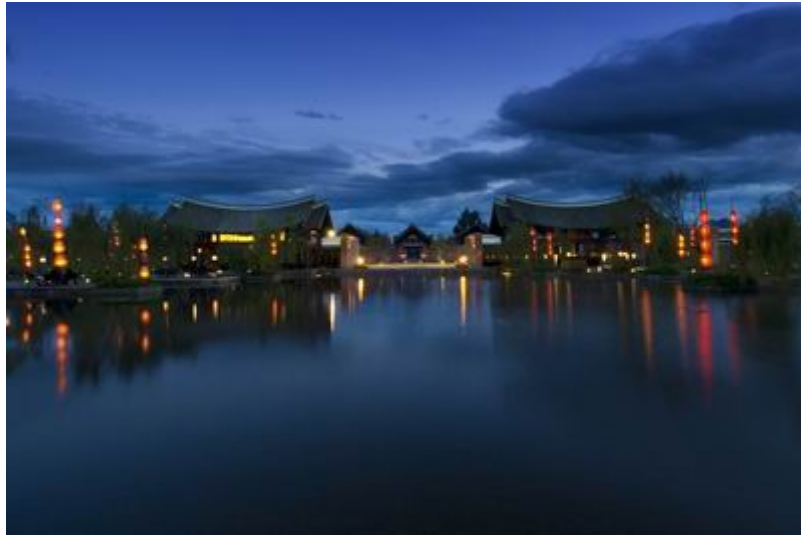
View of Banyan Tree spa hotels in China

As the twin brand of Banyan Tree, Angsa has been well-known by the Chinese market since the first entry of Banyan Tree group.