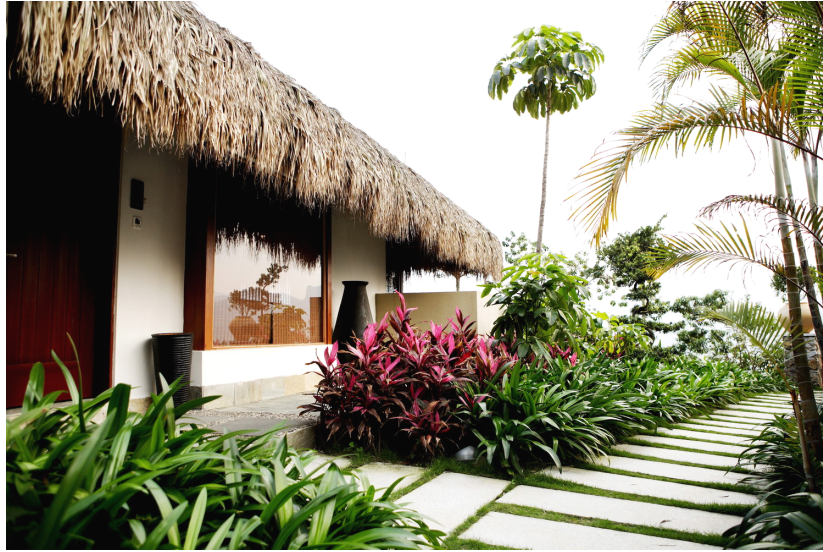
Resort with Bali Style at Nankunshan Mount