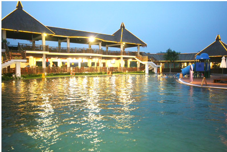
View of Trithorn Hot Spring Resort at Xiamen