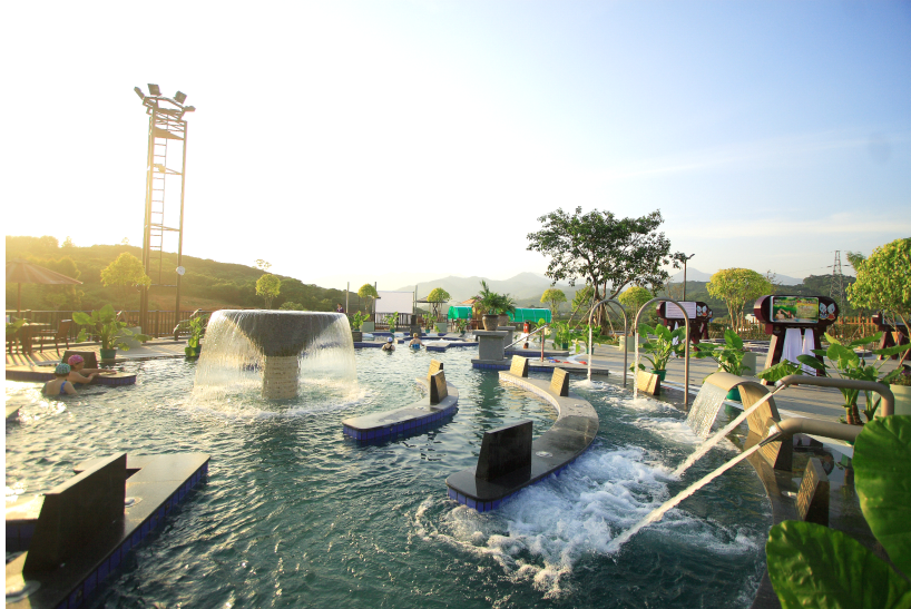
View of Trithorn Hot Spring Resort at Xiamen