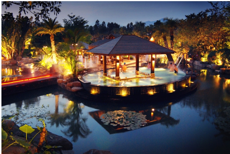
View of Riyuegu Resort at Xiamen