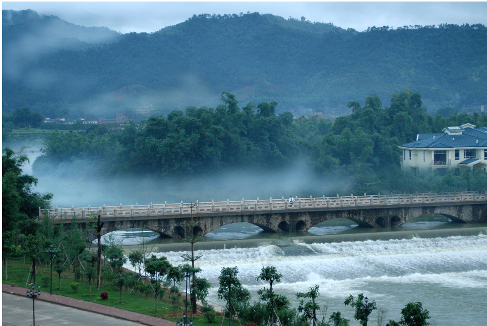
A glimpse of Nankunshan Mount

Equipped with luxury suites, VIP villas, Restaurant with Chinese and Western gourmet, water parks, Yuding Hot Spring Resort has attracted a large number of customers due to its picturesque landscape and gorgeous decorations in line with Chinese traditions and folk customs, local cultures and handicrafts.