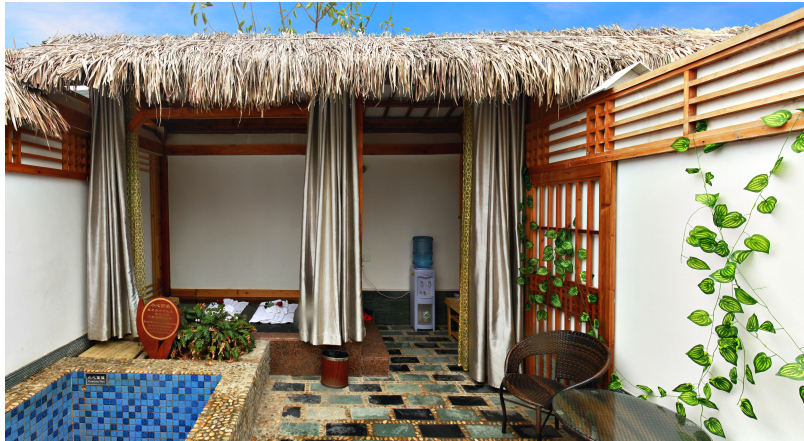
View of Tianmu Hot Spring Resort at Xiamen