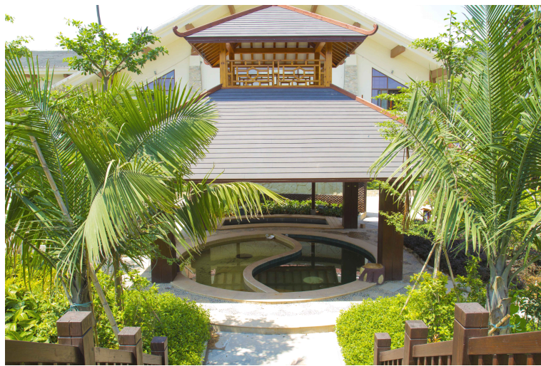
View of Tianmu Hot Spring Resort at Xiamen