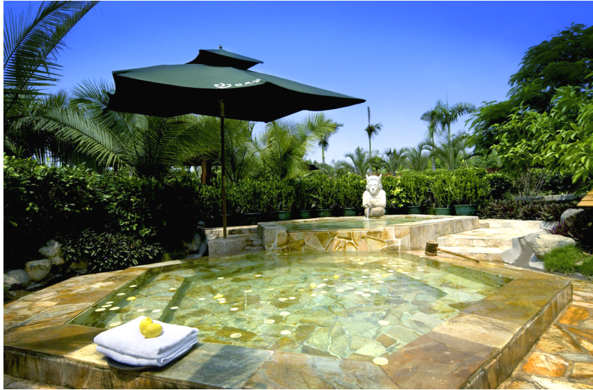
Riyuegu Spring Resort at Xiamen