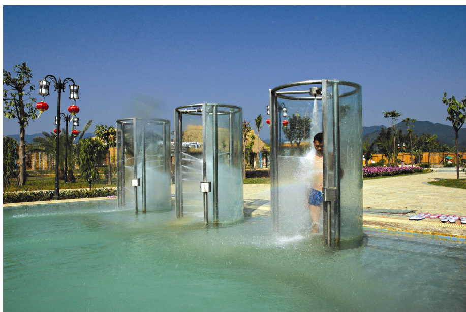
Resort at Nankunshan Mount